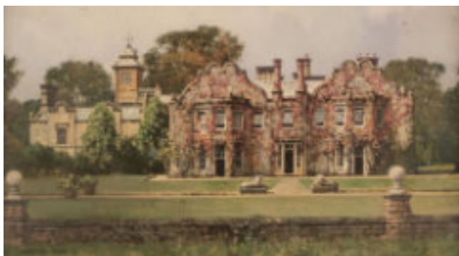
View of Runcton Hall c. 1920's